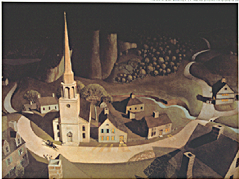
GRANT WOOD'S 'MIDNIGHT RIDE OF PAUL REVERE' (1938)